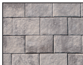
GRANITE CITY BLEND